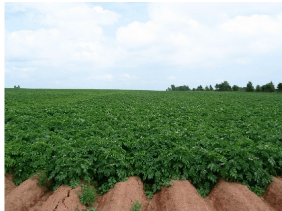
Nutrient Management Demo Field (2004)

In 2003 the P.E.I. Soil and Crop Improvement Association (PEIS CIA) established twelve demonstration plots across P.E.I., comparing producers traditional fertility practices with recommended nutrient management practices in field scale demonstrations over a three year potato rotation. In each year of the demo, four locations are potatoes, four locations are grain, and four locations are forage. Fertility inputs, cropping records, yields and economic data are collected and analyzed for each location.