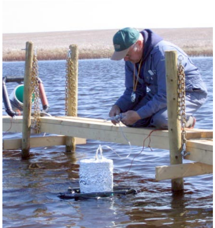
Greenhouse gas samples are also being collected from ponds and sloughs bordering crop land.