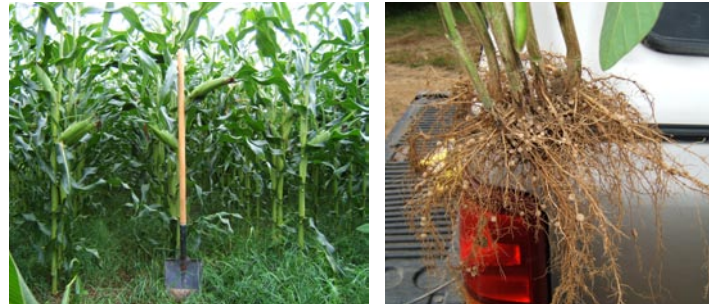
Left: Good broad leaf weed control with only grass under a healthy corn crop

Wet conditions continued during the growing season resulting in additional herbicide treatments to keep weeds in