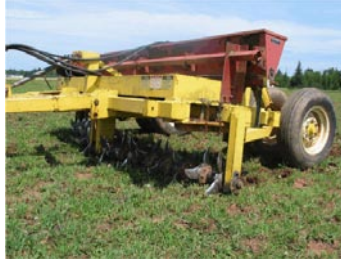
AerWay Pasture Renovator

Since much of the pasture land is on the wetter areas of farms, there are additional challenges to increased production. Soil compaction from animal traffic is one limiting factor as well as the fact that many of the desirable pasture species, especially legumes, have a limited life and must be reseeded to maintain the population.