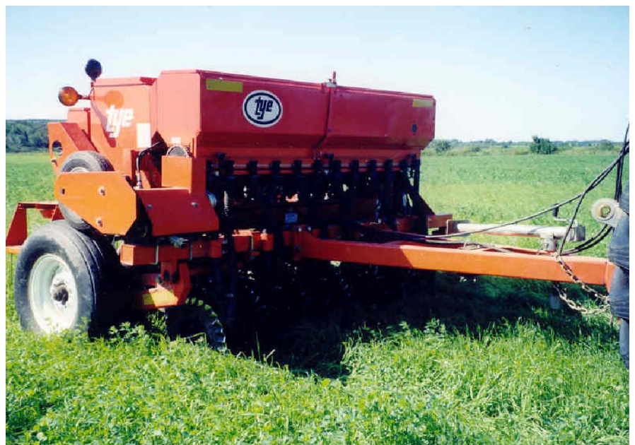
The Tye no-till seed drill is available to Nova Scotia producers