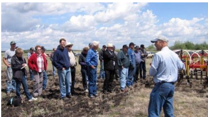
Above, and right, Alberta producers watch no-till drills in action and listen to farmers describe their direct seeding experience

The direct seeding into sod aspect of the demonstration provided an opportunity to showcase the fastest growing area of direct seeding. Farmers and ranchers are adopting sod seeding as a way to increase productivity, reduce fuel consumption, minimize equipment usage and save valuable hours of farm labour. The technique also virtually eliminates the potential for soil erosion that has always been associated with removal of forages with intensive tillage practices.