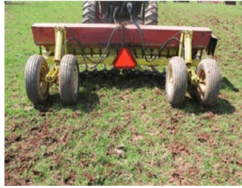
Tillage from 10 degree roller angle.

There are many different ways to renovate pasture with the most popular on PEI being to plow the pasture and plant a grain crop under-seeded with a pasture mix. This is an expensive and time consuming option in that the land is taken out of pasture production for at least one full year.