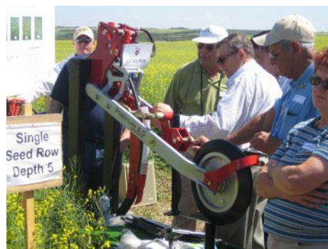
CAAPAS delegates check out the ConservaPak seeding system at the Halford Farm

The congress continued in Regina at the Radisson Hotel Saskatchewan for the rest of the week. Agenda topics included country reports on the status of conservation activities in their areas; the adoption levels of no-till; upcoming events and general attitudes of farmers to conservation practices and strategies.