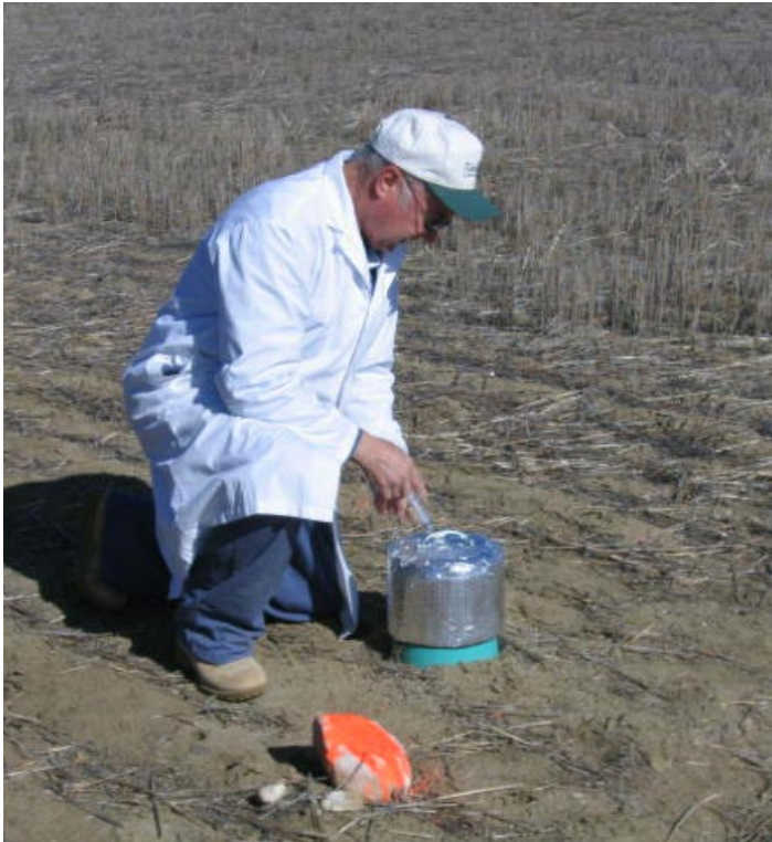
Technician collects greenhouse gas samples from soil in stubble field